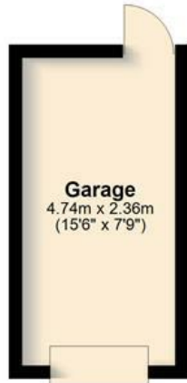
Ground Floor Approx. 11.2 sq. metres (120.5 sq. feet)